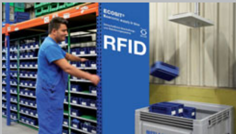
Picture 3 RFID Bin shelf at BOGE